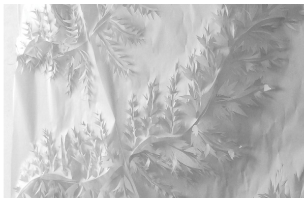
Paprat Fern, 2008.

Svaka Idina cjelina zasebna je etapa smanjenog pritiska, predložena posjetiteljima kao postaja potenciranog opažajnog intenziteta u smislu metaforičke oaze i prilike za plodonosnu introspekciju utaženog pogleda. Riječ je o uvođenju tema rasta, nicanja i poniranja, koje u okruženju kulturnog čitanja mijenjaju ruho, otvarajući prostore novim interpretacijama i asocijacijama – osvajanje, nadilaženje, prožimanje. Sve je ovo blisko vezano uz ideju oprostorenja pogleda koja se nadovezuje na namjeru dematerijalizacije granica, najradikalnije izraženu u ambijentalnoj instalaciji u atriju, čime je naglašen, ali i humaniziran karakter središnje arhitektonske teme muzeja.