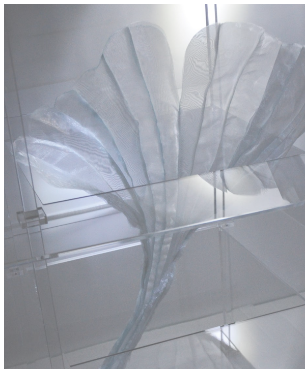
Maketa za ambijentalnu instalaciju Model for ambient installation, 2015.

Designing the museum core as a potent form centrifugally spreading, fed by substance of light and only loosely connected by contours, is a clear expression of the author's initiative – opening the space to aura. On the subjective level the question of the existence of aura, unrelated to the discussion on the original and the copy, is relevant here, through the aspect of considering the uniqueness of the experience in a very elementary sense, as a measure of the quality and quantity of human life.