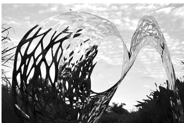
Vjetar II Wind II, 2012.

On the horizon of vitalist poetics based on the interpretation of natural phenomena and processes, the scope of Ida Blažičko's ambient installations in the museum space is outlined. Achievement of the dialogue is interpreted by the artist through design of several new spatial situations that push the limits of observation demanded by the horizontal curve of exhibited objects, that soften the unification of pre-set attitude and that change the atmosphere by activating passive zone areas. Forbearingly, she takes over only a few halls, and sets them prominently apart from the rhythm of the equitable distribution of attention, in the spirit of self-imposed bustle which usually guides visitors on their tour of the extensive museum displays.