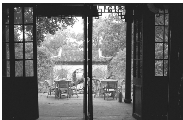
Skriveni vrt, Hidden garden, 2015.

Doživljaj preobrazbe, neuhvatljivosti, nepredvidljivosti i potencijalne neograničenosti procesa imaginarne nadogradnje u subjektivnom doživljaju ovisе o raspoloženju unutrašnjeg oka svakog pojedinog promatrača. Ida Blažičko posjetiteljima je ponudila smisaono i doživljajno artikuliranu organsku dijalektiku koja se ostvaruje kroz pomicanje granica između unutrašnjeg i vanjskog, volumena i prostora — muzeja oko nas i svjetova u nama.